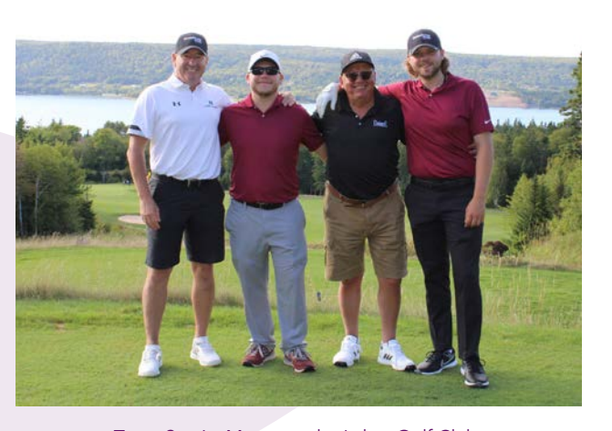
Team ServiceMaster at the Lakes Golf Club.

To-date, Golf Because You Care has raised more than $195,000.00 for health care in our community.